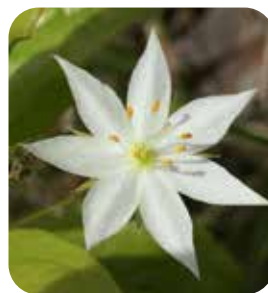
Starflower

I have been keeping a nature journal for two years now and I share some of my observations via the Harpswell Nature Watchers Facebook group and email list. It has been